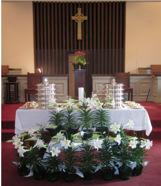
Hunter's Sanctuary on a previous Easter Sunday