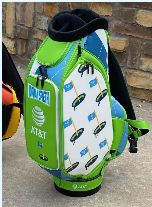
The golf bag Joyce designed